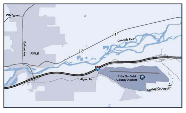
AIRPORT VICINITY MAP

THE PREPARATION OF THIS DOCUMENT MAY HAVE BEEN SUPPORTED, IN PART, THROUGH THE AIRPORT IMPROVEMENT PROGRAM FINANCIAL ASSISTANCE FROM THE FEDERAL AVIATION ADMINISTRATION (PROJECT NUMBER 3-08-0048-022) AS PROVIDED UNDER TITLE 49 U.S.C., SECTION 47104. THE CONTENTS DO NOT NECESSARILY REFLECT THE OFFICIAL VIEWS OR POLICY OF THE FAA. ACCEPTANCE OF THIS AIRPORT LAYOUT PLAN BY THE FAA DOES NOT IN ANY WAY CONSTITUTE A COMMITMENT ON THE PART OF THE UNITED STATES TO PARTICIPATE IN ANY DEVELOPMENT DEPICTED THEREIN NOR DOES IT INDICATE THAT THE PROPOSED DEVELOPMENT IS ENVIRONMENTALLY ACCEPTABLE OR WOULD HAVE JUSTIFICATION IN ACCORDANCE WITH APPROPRIATE PUBLIC LAWS.