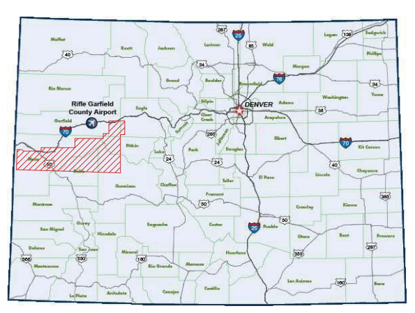
COUNTY MAP NO SCALE